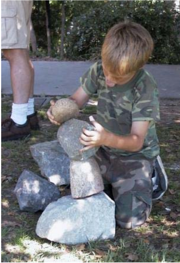
The tongue, a sign of concentration