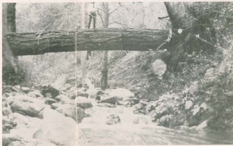
FAUMA TROUT STREAM