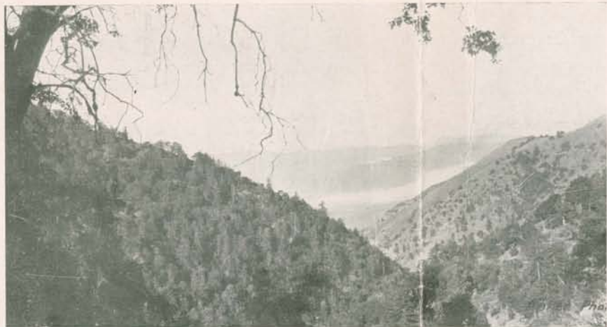
ABOVE THE CLOUDS