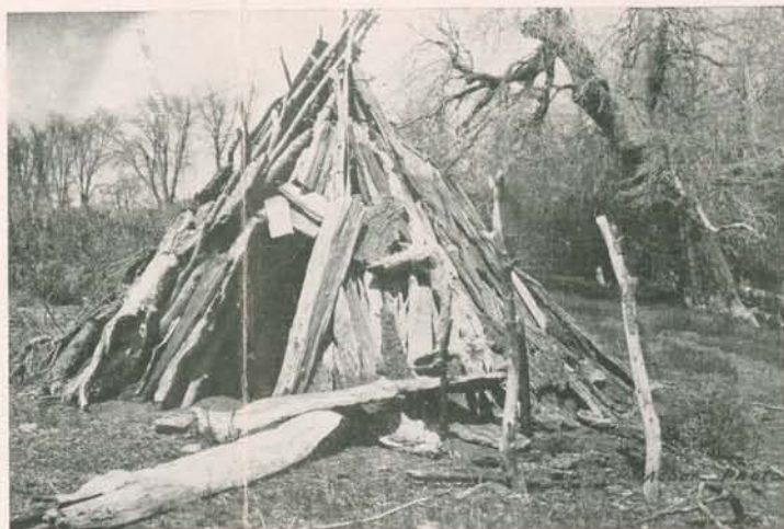
AN INDIAN TEPEE