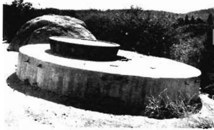
"Concrete eye" which doubled for the famous 200-inch mirror during construction

has been used successfully as an aid in relieving and preventing nausea when traveling by boat, train, bus, motor or plane. Ask your druggist for special children's capsules, or write us direct 26 MOTHERSILL'S, 430 Lafayette St., New York 3, N. Y.