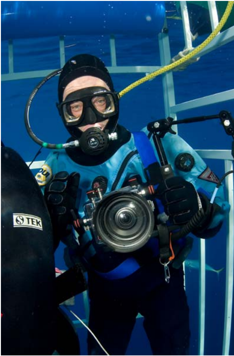
Text and photographs ©Peter Brueggeman