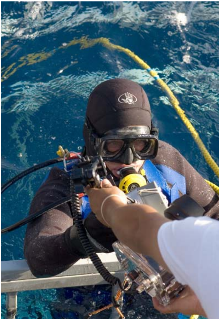
Being handed my camera after climbing down into the cage