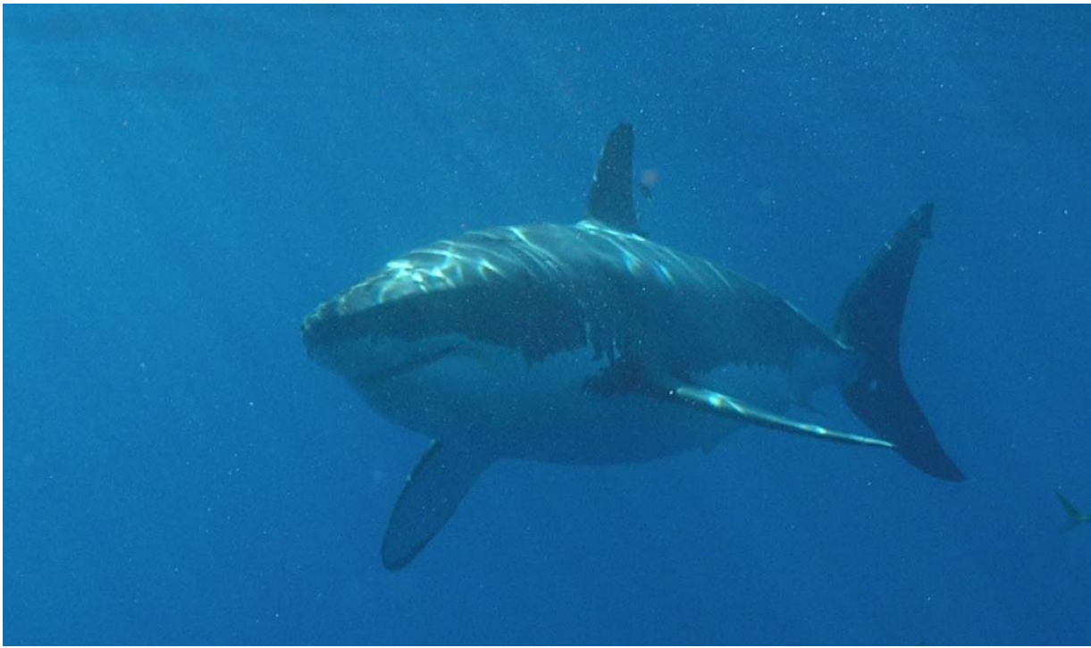
Mr. Big patrolling by