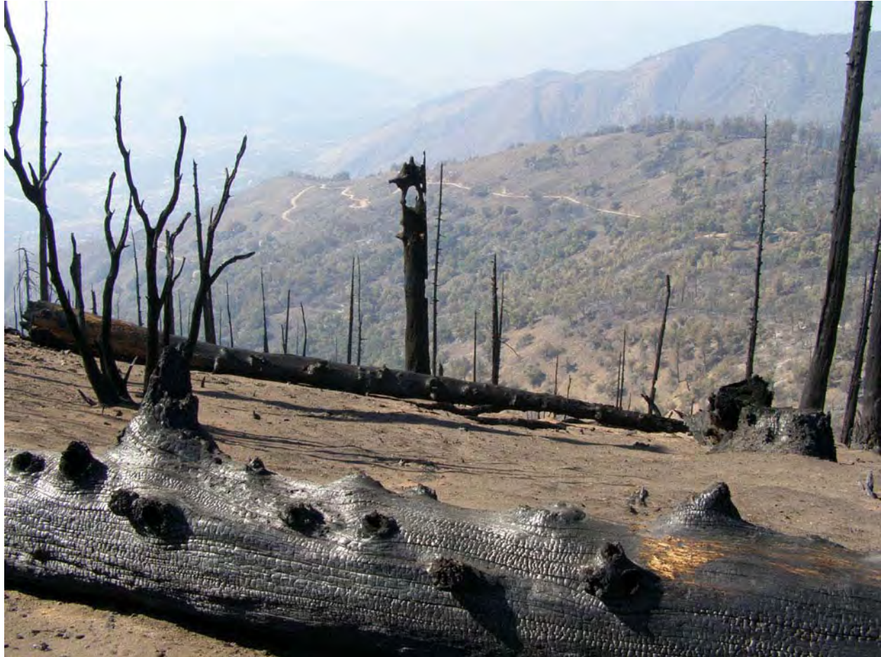
Figure 3. Ground surface cover and visibility both in fire-affected areas (foreground) and non-fire-affected areas (background).