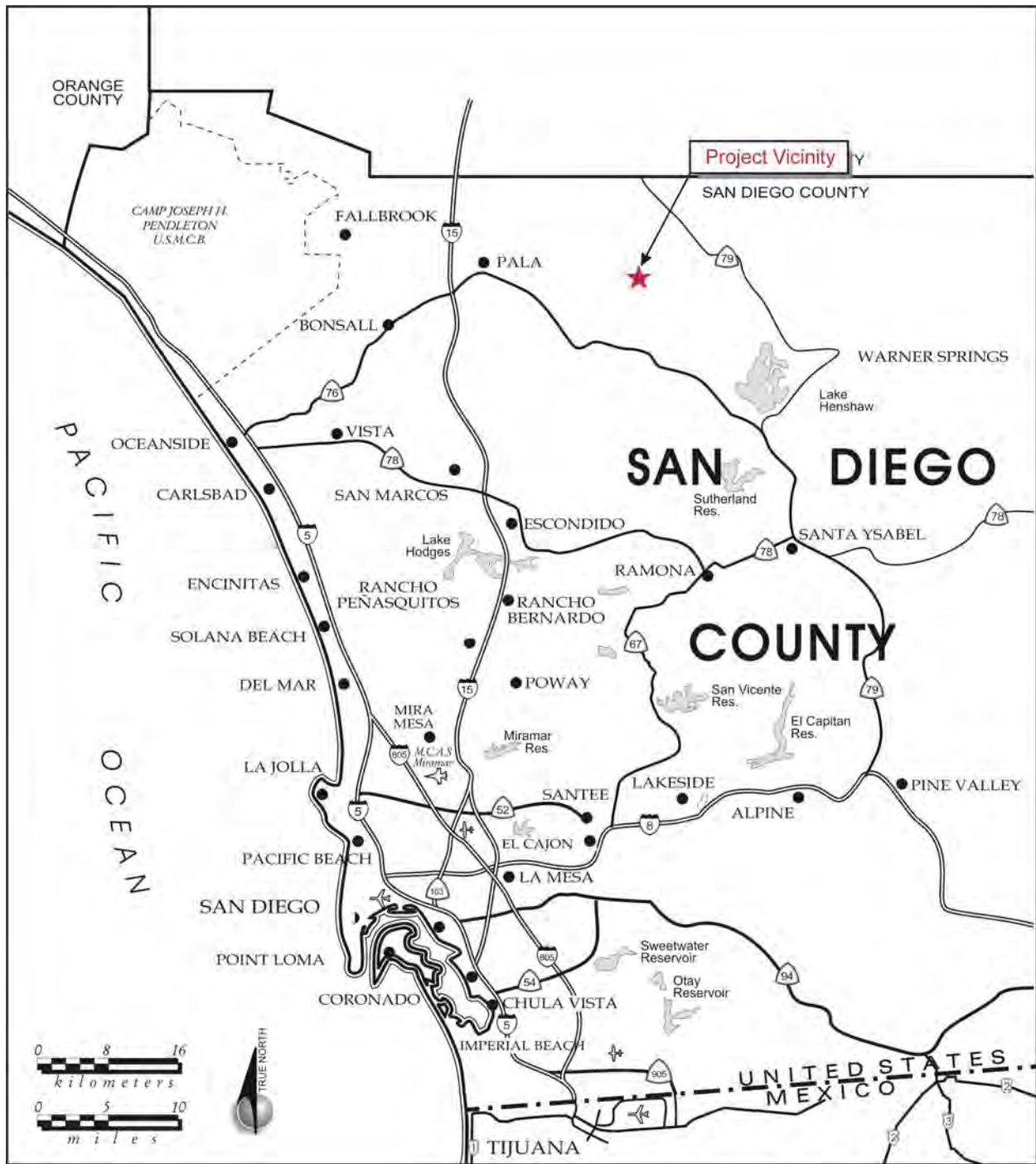
Figure 1. Project location map.

Palomar Mountain is the wettest and coolest location in San Diego County. It receives between 30 and 70 in. of annual rainfall, averaging approximately 48 in. The mountain has up to 40 in. of annual snowfall. The average temperature is 85° F in July, and the January average is 32° F. The highest point is 6,140 ft. above sea level.