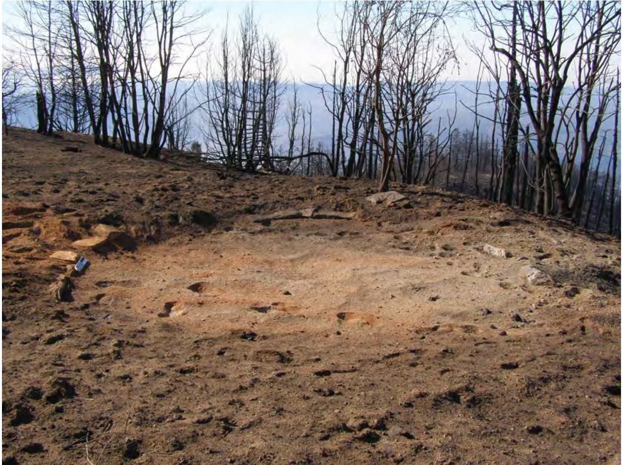
Figure 6. SDI-18916, semicircular rock alignment.

visibility in more densely forested burned areas, lessening the chances of discovering isolated artifacts, artifact scatters, and midden, regardless of whether or not they are associated with obvious bedrock milling sites.