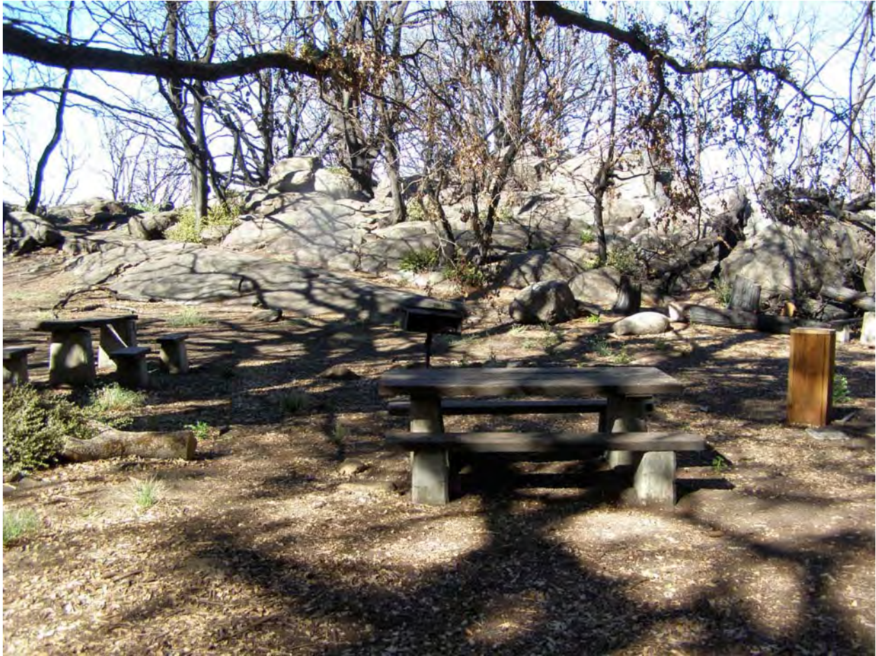
Figure 4. SDI-217, large summer campsite.