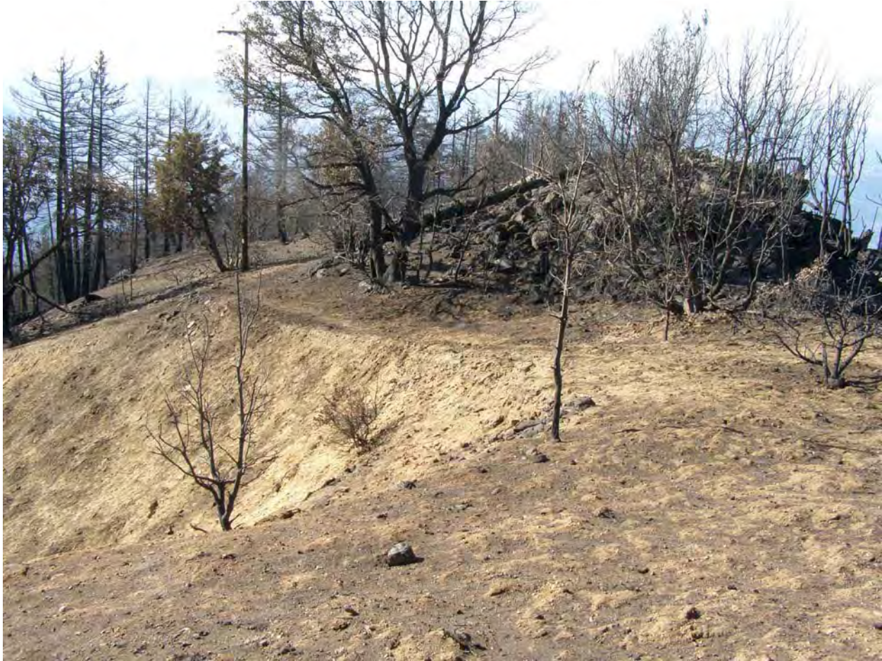
Figure 5. SDI-18882, small temporary campsite.

sherds, one white earthenware bowl fragment, one white earthenware plate fragment with a British Coat-of-Arms style “Ironstone” mark (probably late nineteenth century), two historic earthenware sherds, a light green bottle glass fragment, one clear glass bottle fragment, one white button, and one metal paint bucket. Two fragments of shell were observed; these may be prehistoric or historic in age.