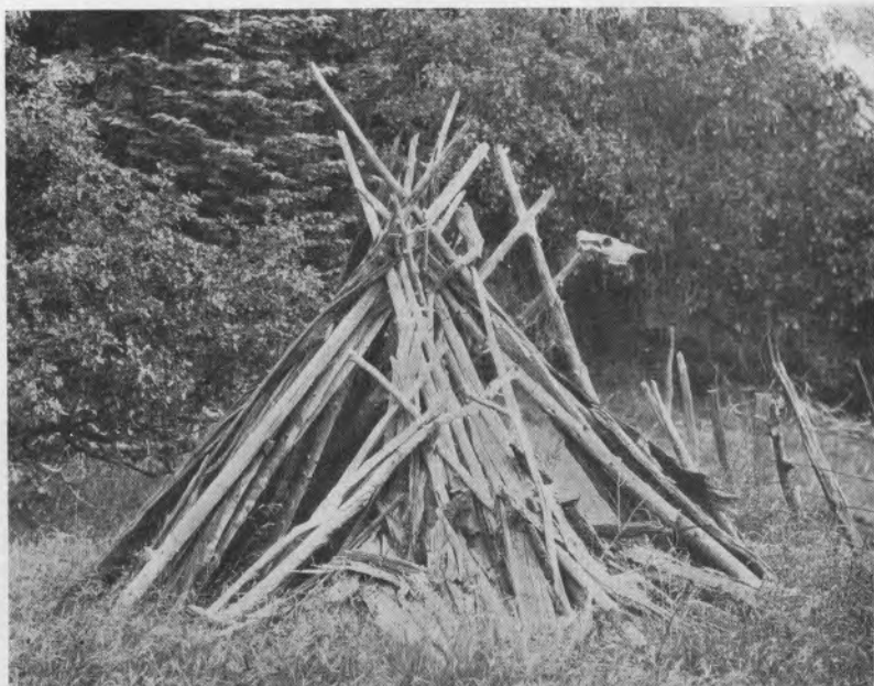
FIG. 90.—The last Indian house in the coast region of southern California, on top of Palomar Mountain above Kuuki rancheria.